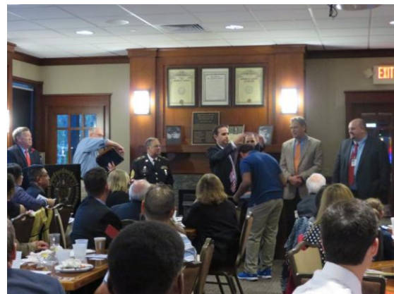
Class of 2017 Military Inductees Recognition Ceremony.