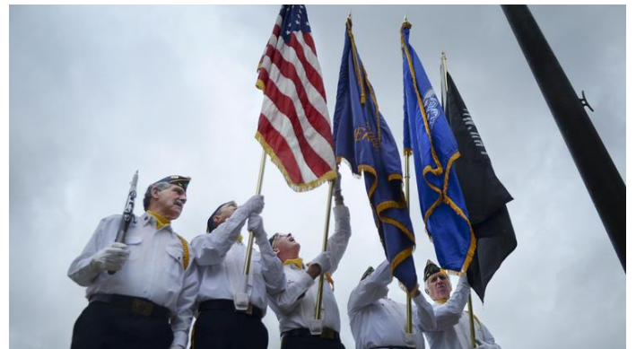
Hayes-Velhage Post 96 Color Guard at Memorial Day Ceremony at Town Hall