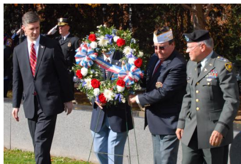
Wreath Placement Ceremony