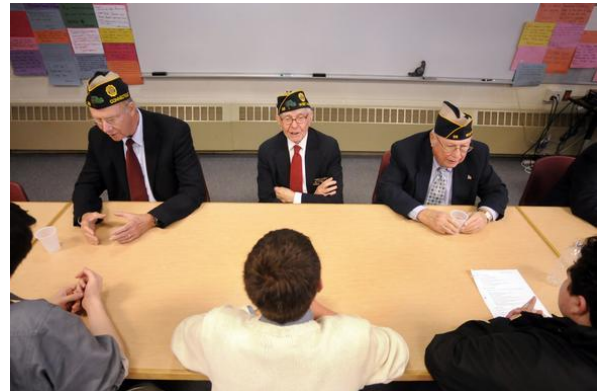
Post members at Hall High School.