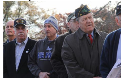
Post Members at Charter Oak International Academy