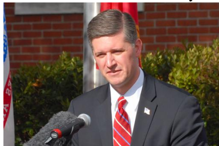
Mayor Scott Slifka