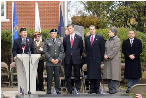
Veterans Day Ceremony