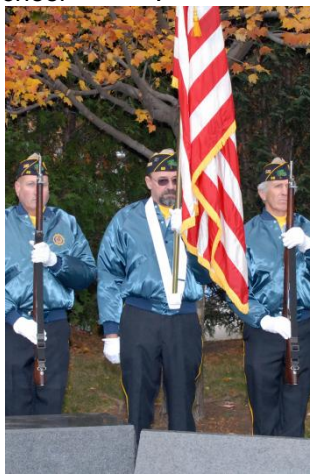
Post Honor Guard