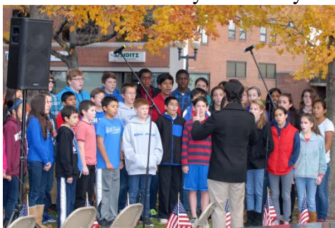
King Phillip Middle School Singers