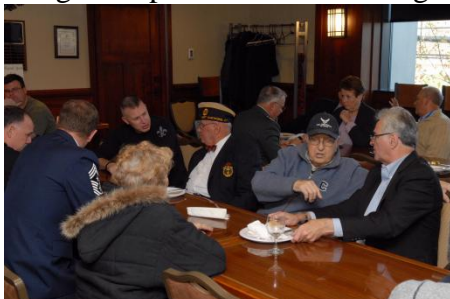
Veterans Luncheon at Post 96